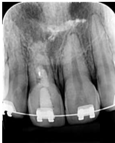
Figure 5: Control after 7 months

After six months, there were no clinical signs and symptoms, such as pain on palpation or percussion. On radiographic examination, a significant regression of the periapical lesion, increase of radicular wall thickness and onset of radicular apex formation was observed (Figure 5). At the sensitivity test with Spray refrigerant, the patient did not feel pain, but reported feeling the presence of the cold stimulus.