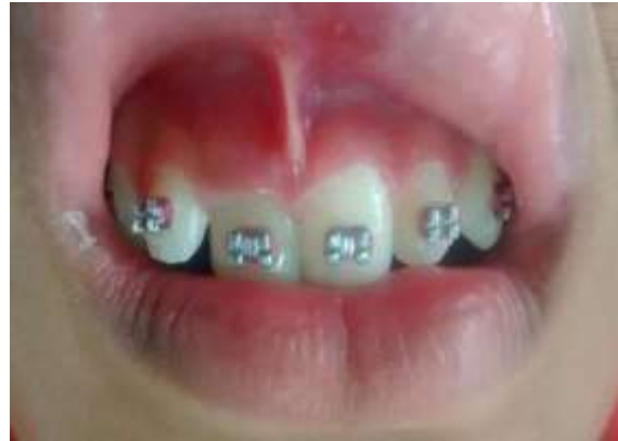
Figure 4: Absence of fistula after 1 week

Irrigation was performed with 10ml NaOCl at 2.5% to remove necrotic remains from the interior of the canal. Ultrasonic passive activation (PUI) was performed with an ultrasonic tip E1- Irrisonic (Helse, SP, Brazil), in 3 cycles of 20 seconds, 2.5% NaOCl, 17% EDTA and 2.5% NaOCl (11).