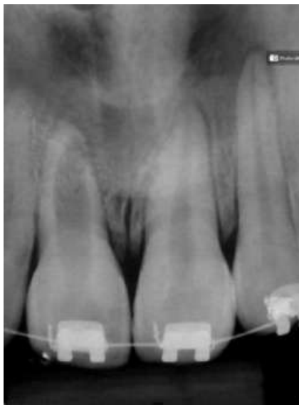
Figure 2: Initial radiograph.

The tooth had a negative response to the palpation, vertical and horizontal percussion tests and the sensitivity test. Radiographic examination revealed that the root canal presented incomplete rhizogenesis (Figure 2). The orthodontic wire was removed and the fistula was screened using a gutta-percha cone (Figure 3).