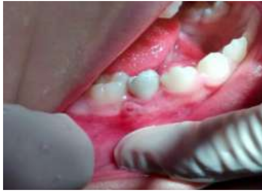
Figure 6: Clinical aspect - presence of fistula

In the initial radiography, occlusal decay was observed, apex with incomplete formation and periapical lesion on tooth 33 (Figure 7).