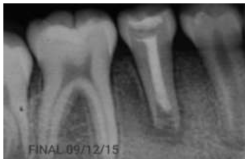
Figure 8: Final radiography

Soon after, a cervical barrier of MTA and double sealing with glass ionomer and the composite resin was made. After removal of the rubber dam, a final radiograph was made (Figure 8).