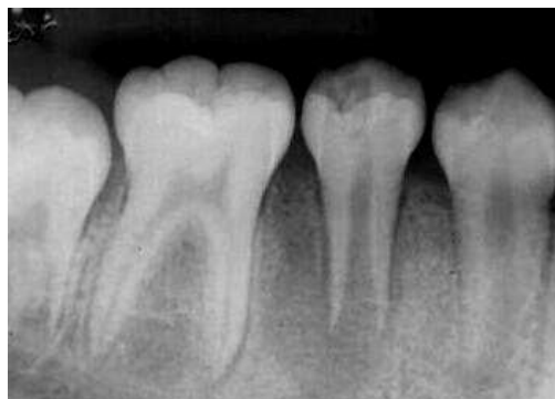
Figure 7: Radiographic appearance - incomplete rhizogenesis

In the initial radiography, occlusal decay was observed, apex with incomplete formation and periapical lesion on tooth 33 (Figure 7).