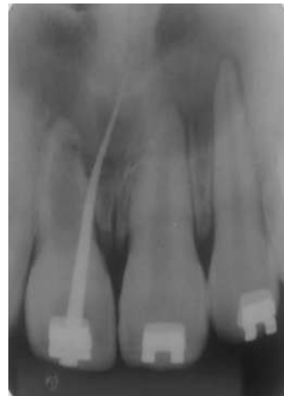
Figure 3: Fistula screening

The tooth was anesthetized with 4% articaine with epinephrine 1: 100,000, absolute isolation was performed using clamp 206. The canal was irrigated with 20 mL of 2.5% NaOCl, draining purulent and bloody secretion. After 7 days, the fistula disappeared (Figure 4).